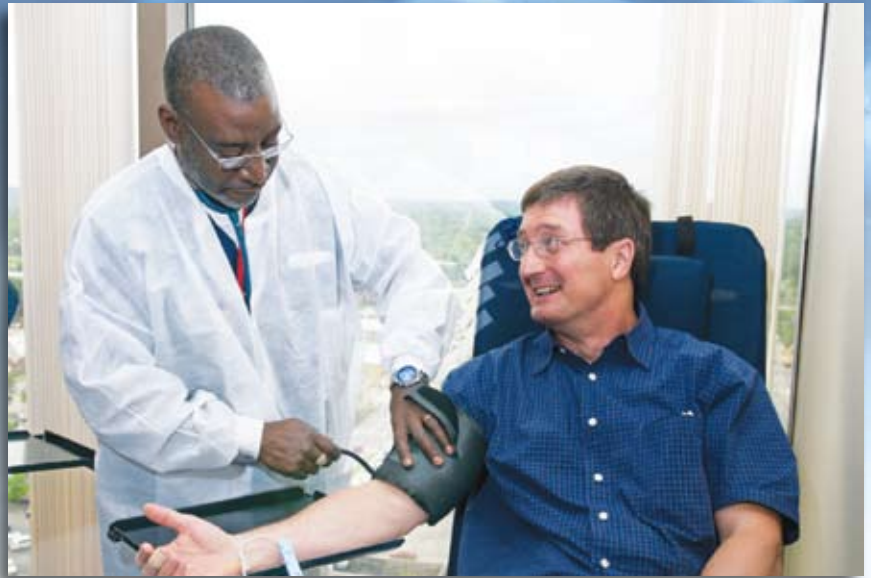
Press Ganey Patient Satisfaction